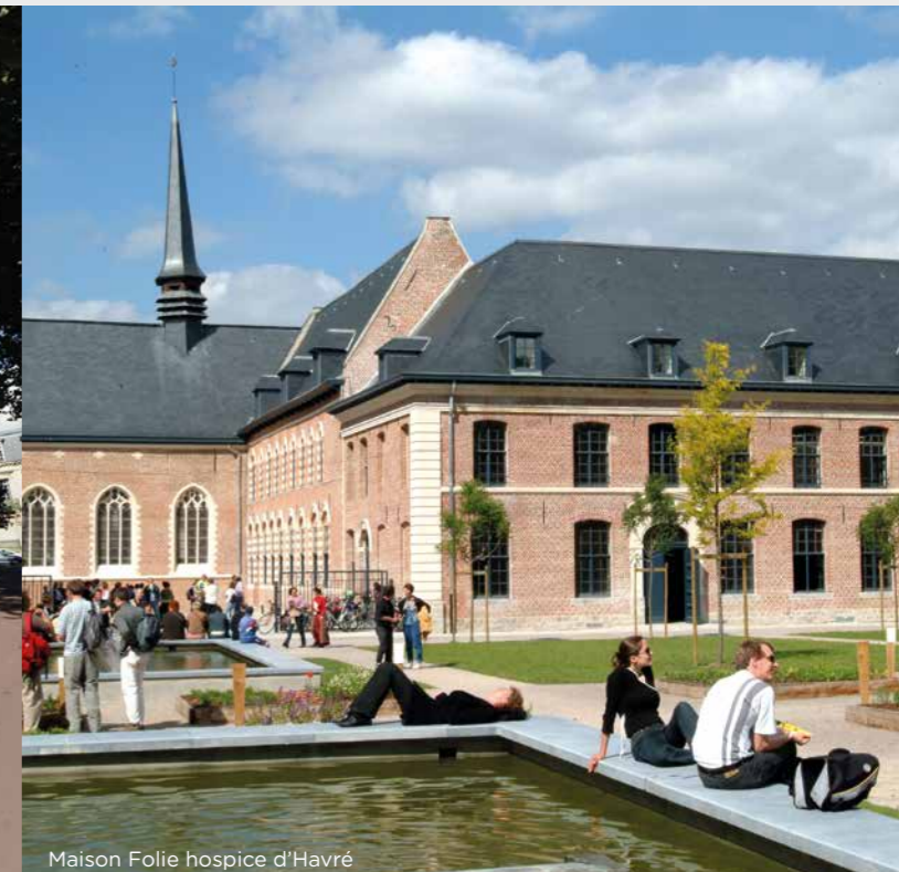
Maison Folie hospice d'Havré